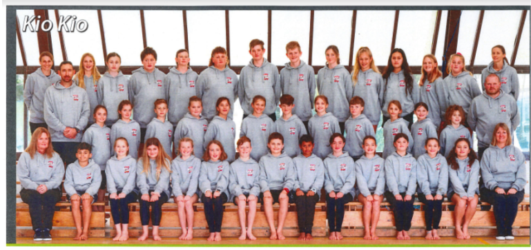
Winners in: Bowls Runners up in: Girls Indoor Hockey, Swimming

Kaimai Intermediate Sports Camp August 2021 totarasprings